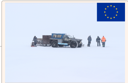
They wanted to go in Europe and in a cold country.